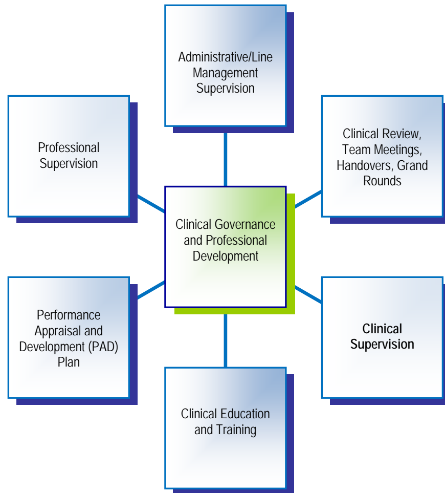
Figure 1: Conceptual map of the array of supervisory activities